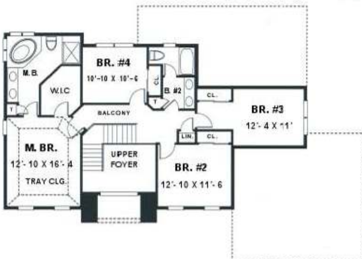
SECOND FLOOR AREA: 1053 SQ. FT.