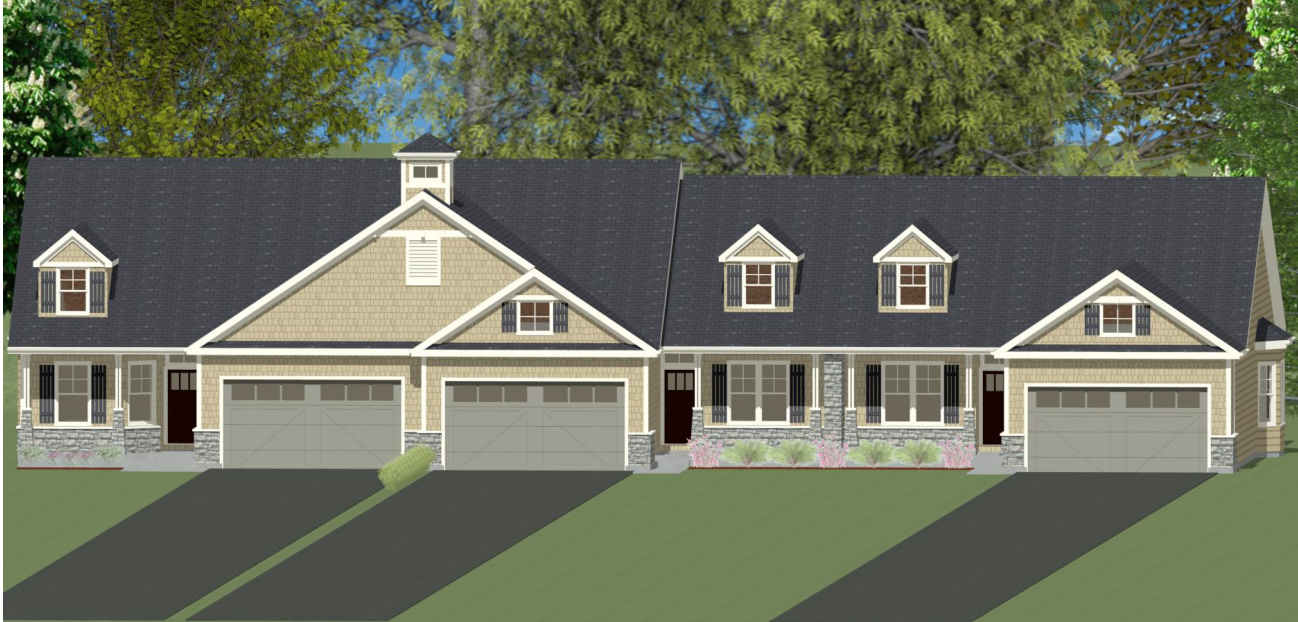
EXTERIOR A-PLAN AREA: 1373 S.F.

1387 FAIRPORT ROAD STE. 560 FAIRPORT, NEW YORK